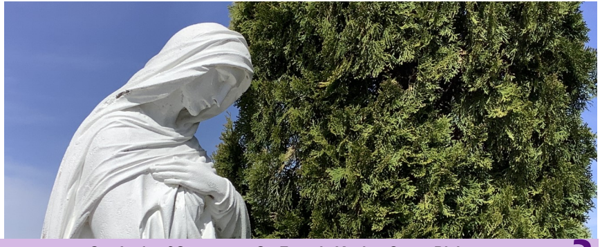
Our Lady of Sorrows at St. Francis Xavier, Cross Plains

VOLUNTEER and EVANGELIZE at the same time! Your good works can be witness to your Catholic faith and shine like a light for others to follow. Many organizations need help right now like: Middleton Outreach Ministry, Pregnancy Helpline, The American Red Cross, your local food pantry. Find a moment in your month to make a difference in our world and community.